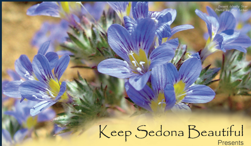
Desert Woolly Star