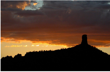
2007 Dylan Sills - Chimney Rock Sunset - First Place Junior