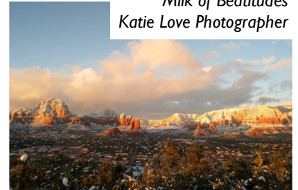
Milk of Beatitudes

KEEP SEDONA BEAUTIFUL 360 BREWER ROAD SEDONA, AZ 86336