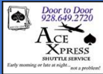
Ace Xpress Shuttle