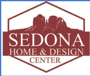
Sedona Home & Design Center