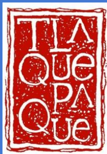
Tlaquepaque Arts & Crafts Village