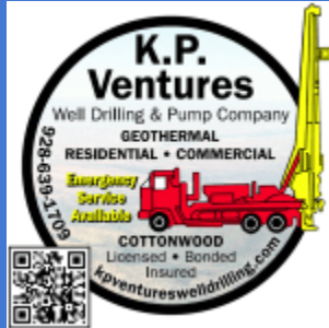
KP Ventures Well Drilling & Pump Company