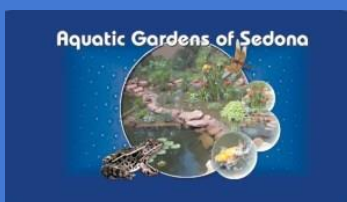
Aquatic Gardens of Sedona 928-451-1657