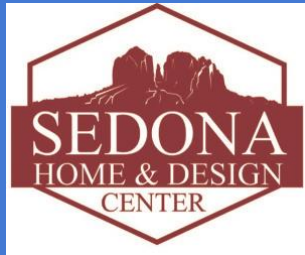
Sedona Home & Design Center