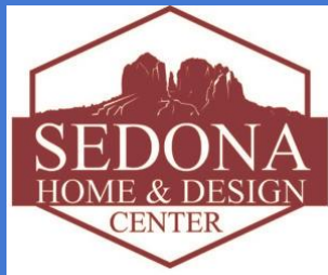
Sedona Home & Design Center