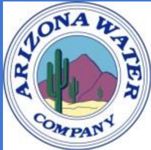
Arizona Water Company