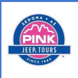
Pink Jeep Tours