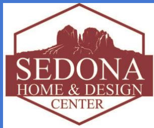
Sedona Home & Design Center