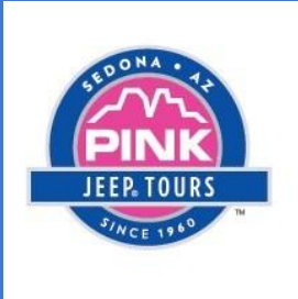
Pink Jeep Tours