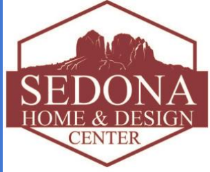
Sedona Home & Design Center