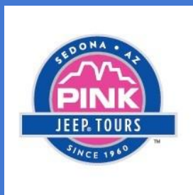
Pink Jeep Tours