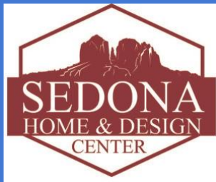
Sedona Home & Design Center