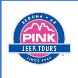
Pink Jeep Tours