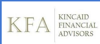
Kincaid Financial Advisors