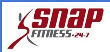
Snap Fitness 24-7