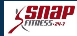
Snap Fitness 24-7

Keep Sedona Beautiful, Inc. Located at 360 Brewer Rd. Sedona, AZ 86336 928-282-4938 info@keepsedonabeautiful.org www.KeepSedonaBeautiful.org