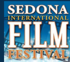
Sedona Film Festival