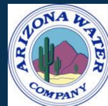
Arizona Water Company