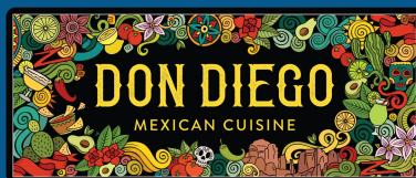
Don Diego Mexican Cuisine