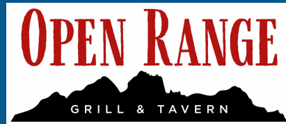
Open Range Grill & Tavern