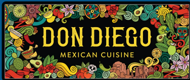
Don Diego Mexican Cuisine