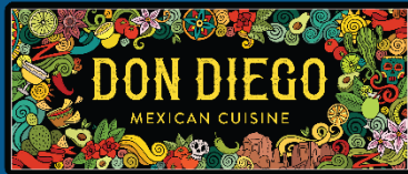
Don Diego Mexican Cuisine