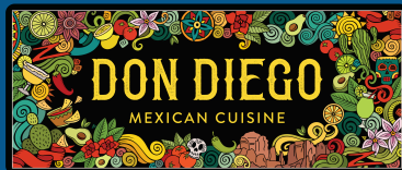
Don Diego Mexican Cuisine