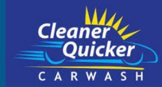
Cleaner Quick Carwash & Detail